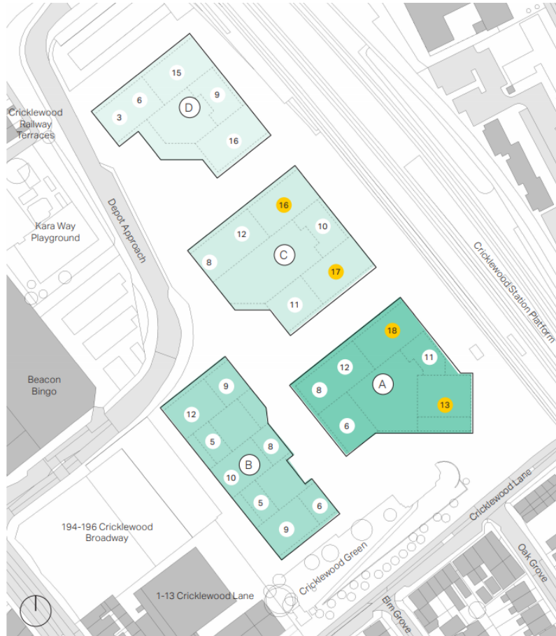
Current Scheme (indicative)