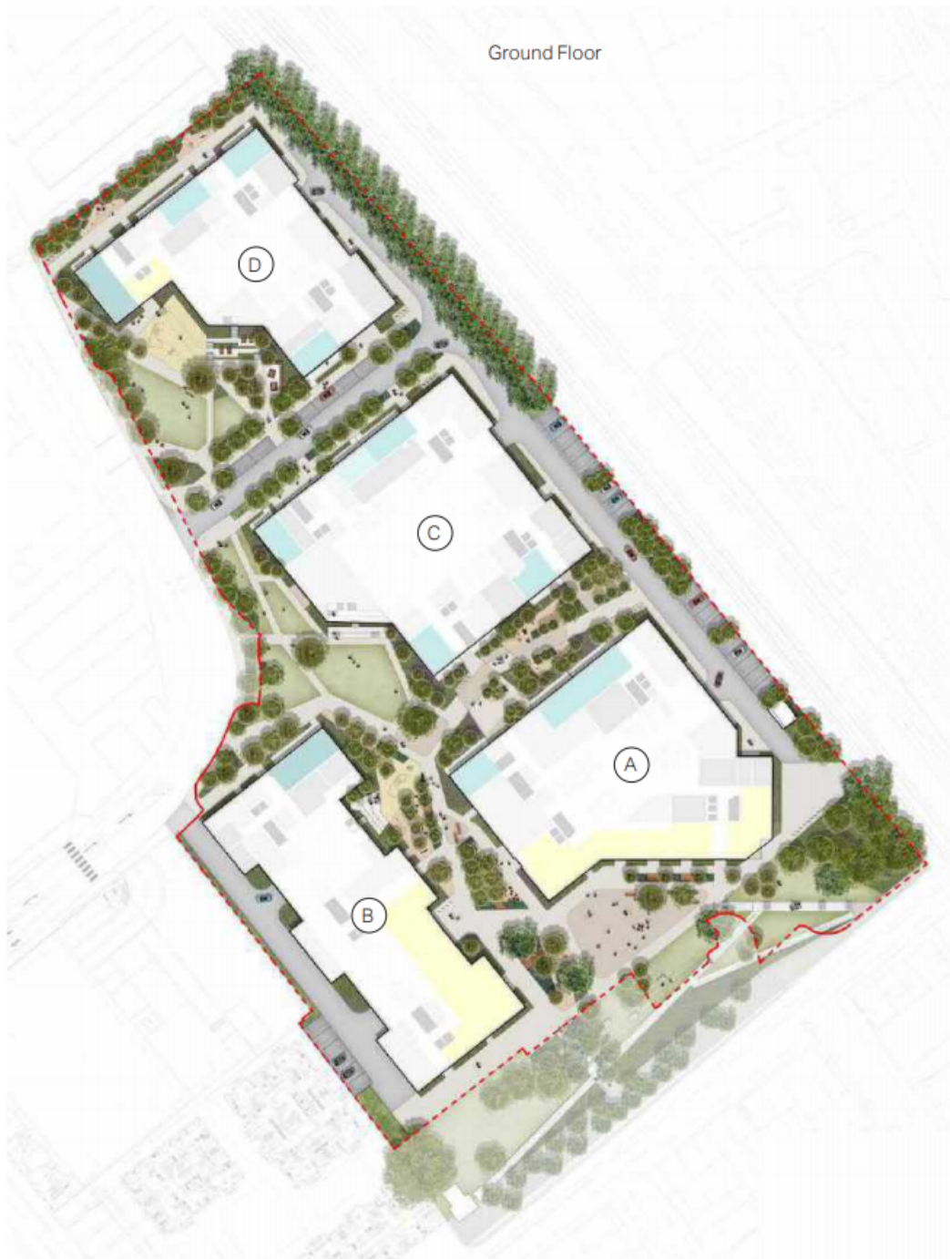
ii) Successful integration into the urban fabric

elevations would incorporate active frontages. Whilst layout and design are reserved matters, outline details set out that residential core entrances would be located on the elevations facing the central public open space whilst flexible use commercial and community uses would be located on the elevations of Blocks A and B facing the new public square and Cricklewood Green. These active frontages comply with the criterion and can be clearly seen in the image below (flexible use units in yellow).